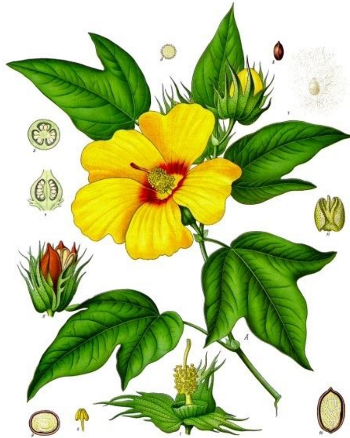
Figure 1 - Köhler, Franz Eugen, Botanical illustration of Gossypium barbadense plant (extra-long staple cotton, Sea Island cotton), 1897

“Prosperity” is the inspirational theme for week 8 of the 52 Sams in 52 Weeks challenge. For the Sams of Datha Island (19th century name), there is a particular source of their prosperity; Sea Island cotton.