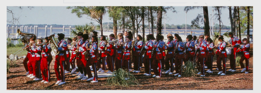
The Lady's Island Middle School Marching Band performed as residents arrived from Beaufort.