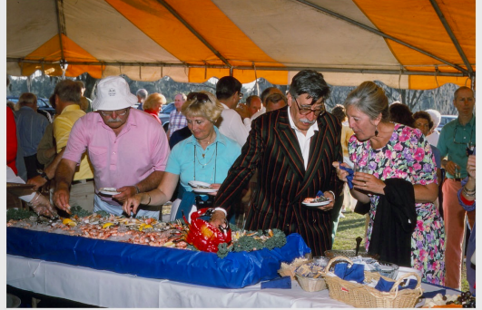
The Marina grand opening festival. A large tent was set up with drinks and elaborate food offerings.