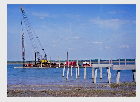
Marina under construction - 1989