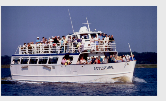
The Grand Opening of the Dataw Marina began with the arrival of Dataw residents sailing in several large boats from the Beaufort downtown marina.