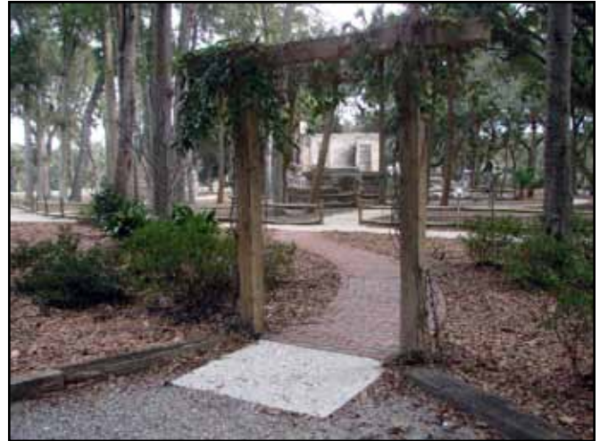
The Dataw Heritage Walk . . . a living legacy to those who have made Dataw the very special place it is today. Check out the beautiful Heritage Walk near the Cannery and the Sams Plantation Ruins.

To purchase a brick, send in the form below. This holiday season would be a good time to add your mark to Dataw's rich history.