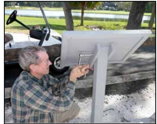
(Photo left) The beautiful new Cotton Dike sign on the fifth hole, ready for everyone to enjoy and understand the history of how Cotton Dike got its name.