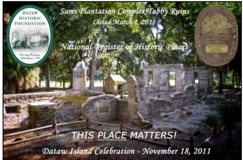
Above) Card given to all guests at the Fireside Chat, celebrating Dataaw's inclusion of its plantation ruins on the prestigious list of historic properties by the National Register of Historic Places.

The National Register of Historic Places is a U.S. Department of the Interior program, begun in 1980, and administered by the National Park Service. This program seeks to preserve our national heritage by recognizing both public and private efforts to set aside and care for sites, buildings, and districts throughout the country which have played a significant role in our development as a nation and as a people. There are about 80,000 such designations in the United States, including the Washington Monument, Independence Hall, and the City of Charleston.